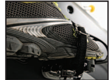
Sports Performance Pedal