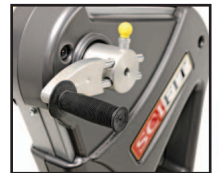
Straight Hand Grips