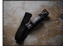
Heart Rate Chest Strap