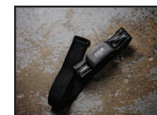
Heart Rate Chest Strap