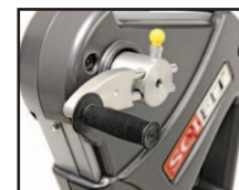
Straight Hand Grips