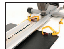
Wheelchair Platform with tethers