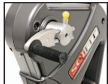
Straight Hand Grips