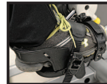
Low Support Boots