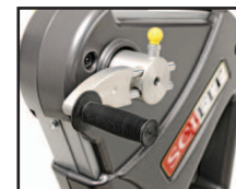
Straight Hand Grips