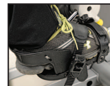
Low Support Boots