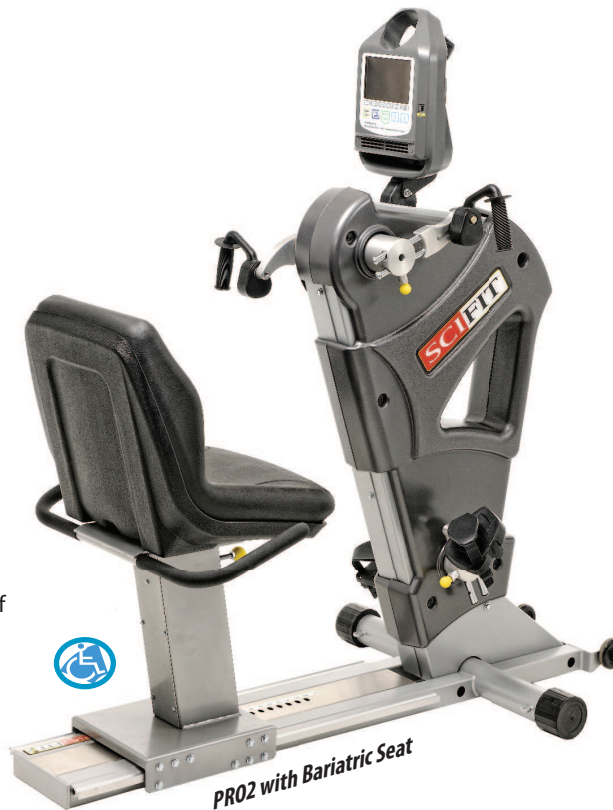
PRO2 with Bariatric Seat