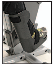
High Support Boots