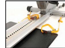
Wheelchair Platform with tethers