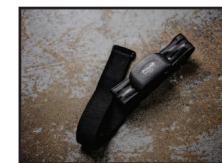
Heart Rate Chest Strap