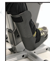
High Support Boots