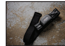
Heart Rate Chest Strap