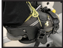
Low Support Boots