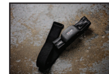
Heart Rate Chest Strap